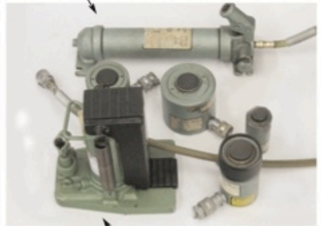
1-SIMPLEX "5" TON LIFT JACK (1PC)